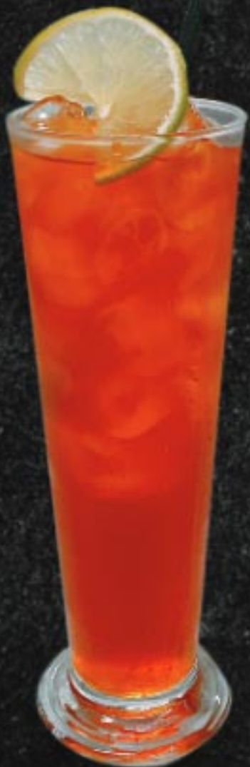
Lemon ice tea $4.90