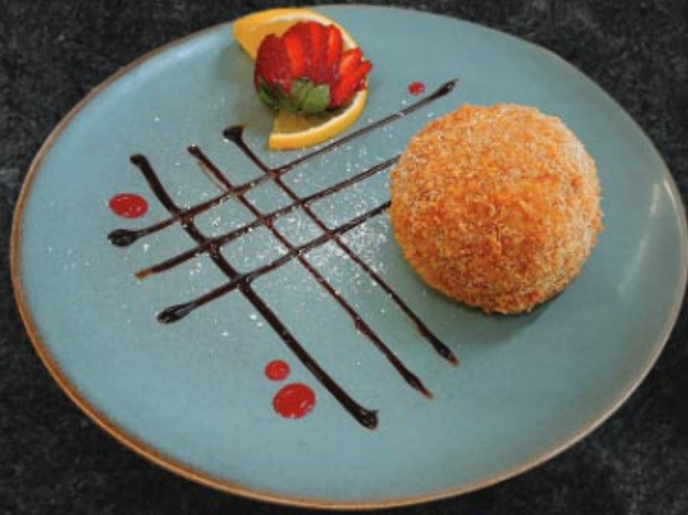
Deep fried ice cream $9.90