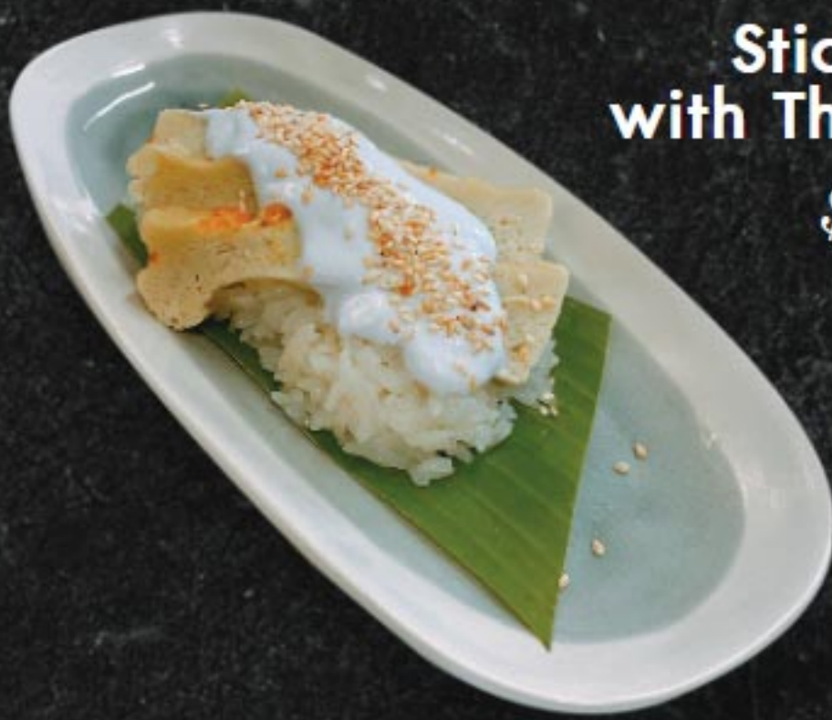
Sticky rice with Thai custard $8.90