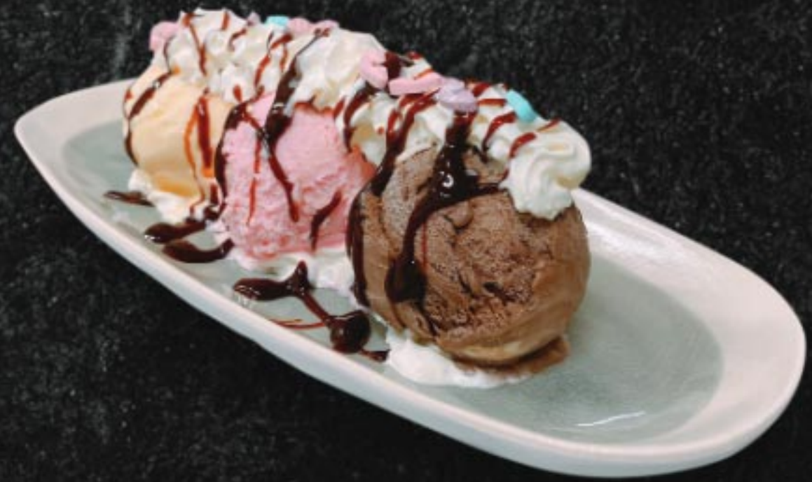
Ice cream with choice of topping $9.90