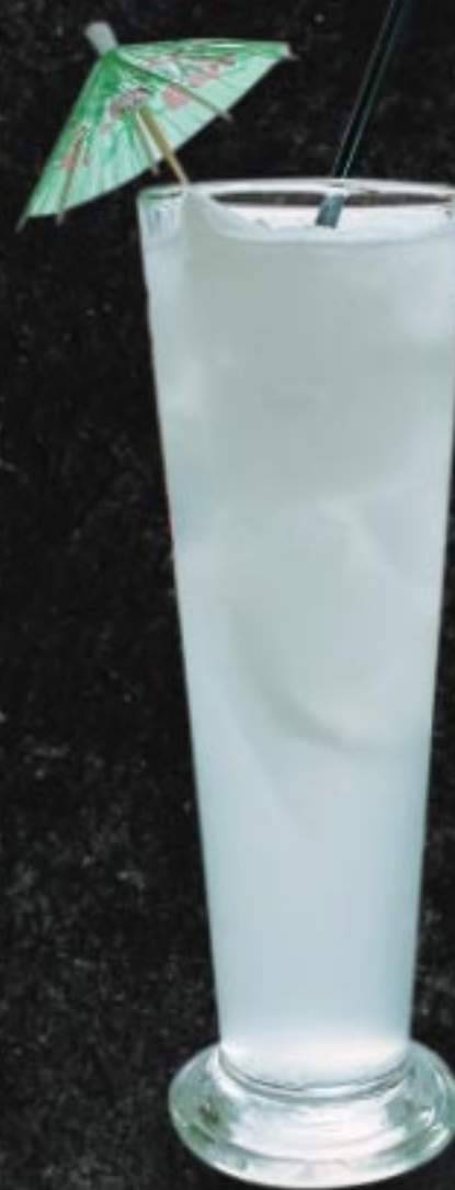
Coconut juice $4.90